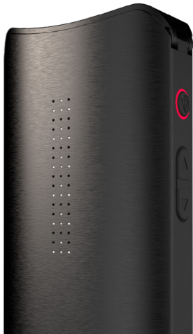
IQ3 shown in Boost Mode

The Control Button will turn red during this function.