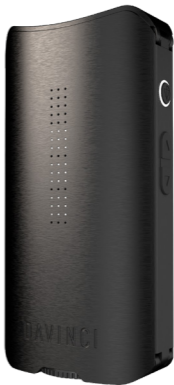
IQ3 shown in Smart Path 3